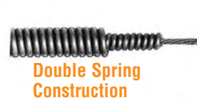
Double Spring Construction