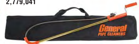
Closet Auger Bag

Closet Auger Bag keeps the closet auger contained and out of sight as it's carried to and from the job.